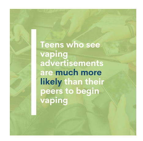
Twitter | Facebook | Instagram | Youtube